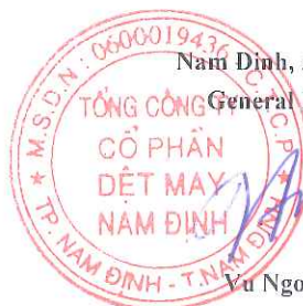
Vu Ngoc Tuan